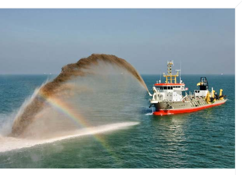
DSTI's swivel joints allow 360° rotation of discharge piping, providing enhanced reliability under demanding operating conditions.